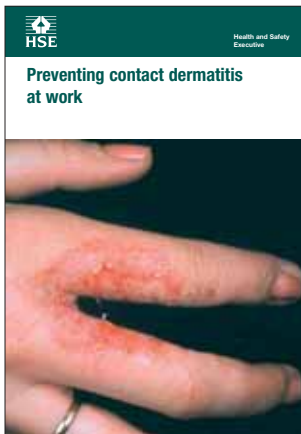
This is a web-friendly version of leaflet INDG233(rev1), revised 03/07

This leaflet tells you about a skin problem that you can get at work – contact dermatitis.